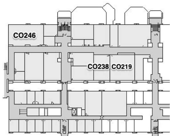
Cotton Level 2

Remember that this event has a code of conduct. See security.ac.nz for details